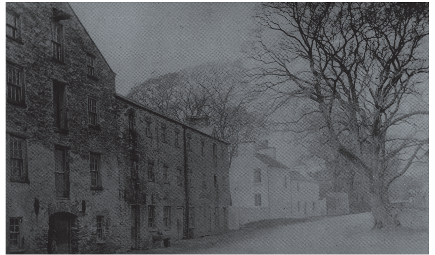
The Mill frontage, 1904

MNH today, showing a picture of the mill on one side and the words 'Flail and Fleece' on the other, with the value shown of five shillings. It was after the building of the second mill that the village got its new name of Union Mills instead of Mullin Doway.