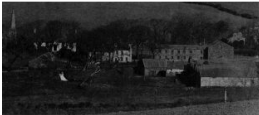
The Mill and weaving sheds from the south c. 1920s

So successful was his business that he issued his own card tokens for small change. One of these still exists at