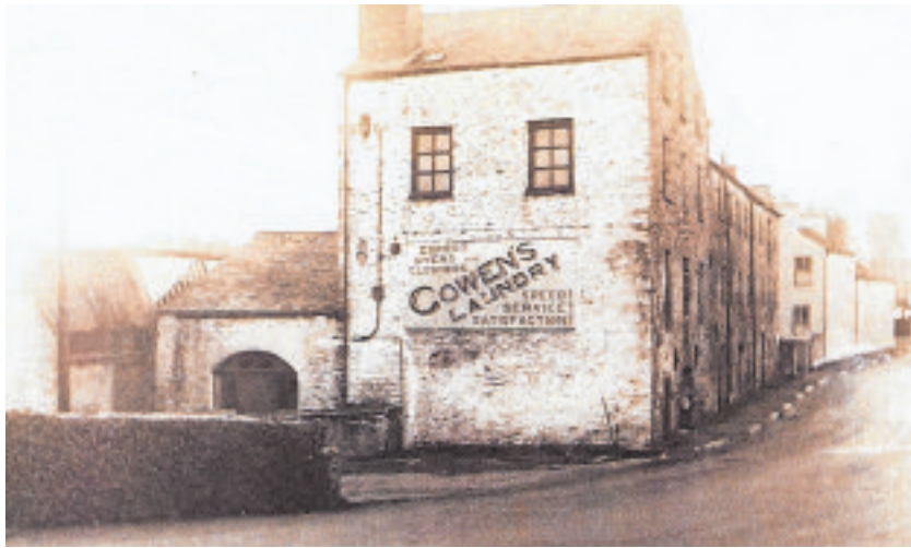
The former mill buildings when used as Cowen's Laundry c. 1920s