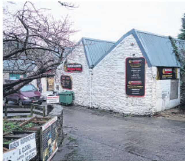
The weaving/finishing sheds behind the mill, enjoying a new life