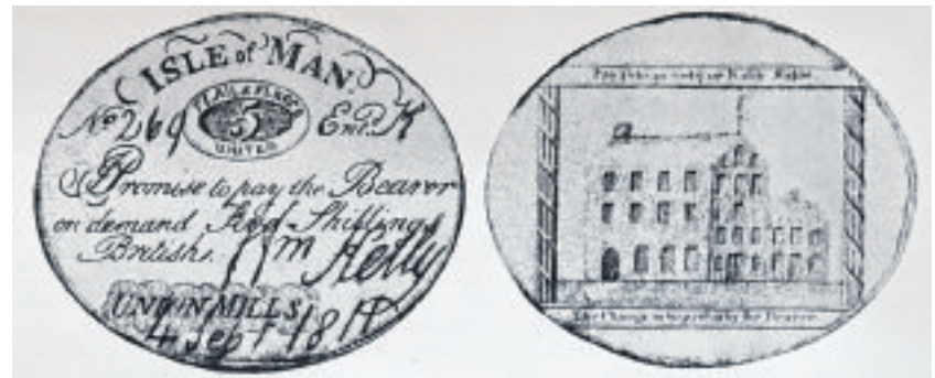
Five-shilling card money token issued in 1819 by the 'Union Mills Ltd', with their 'Flail and Fleece United' logo on the front and a drawing of the mills on the reverse (Journal of the Manx Museum)