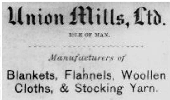
Advertising card for the mill

Some of the weaving sheds remain and have found other new lives nowadays, but the mills' main and enduring legacy is their name – Union Mills.