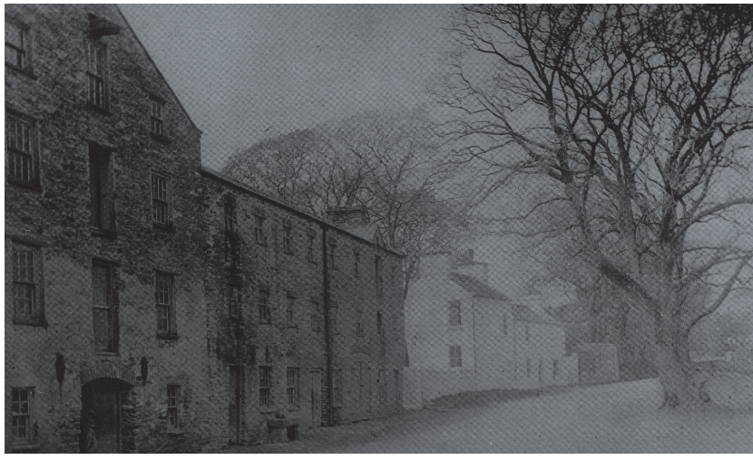
(Tony Kneale) The Mill frontage, 1904

MNH today, showing a picture of the mill on one side and the words 'Flail and Fleece' on the other, with the value shown of five shillings. It was after the building of the second mill that the village got its new name of Union Mills instead of Mullin Doway.