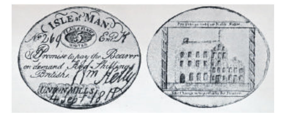
Five-shilling card money token issued in 1819 by the 'Union Mills Ltd', with their 'Flail and Fleece United' logo on the front and a drawing of the mills on the reverse (Journal of the Manx Museum