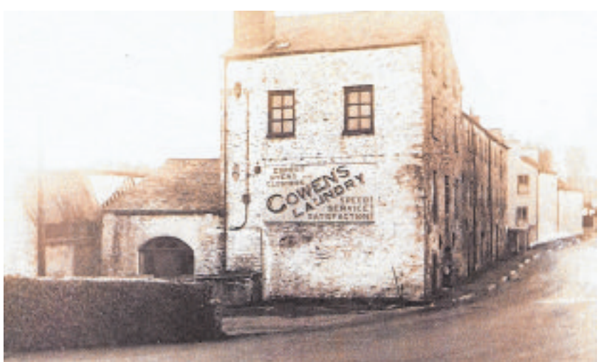
The former mill buildings when used as Cowen's Laundry c. 1920s

Tuesday, December 17, 2019 www.iomtoday.co.im