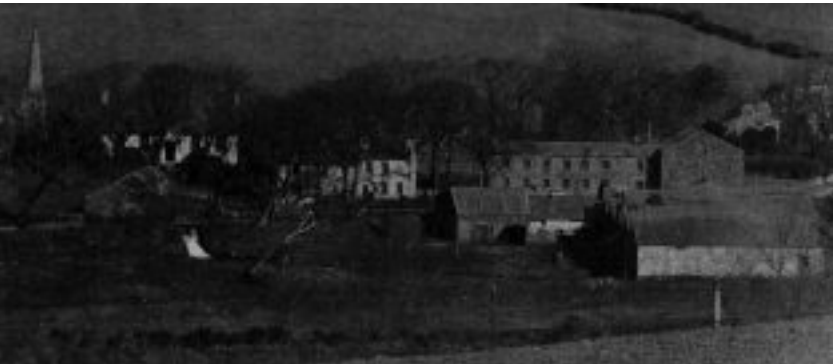
The Mill and weaving sheds from the south c. 1920s

So successful was his business that he issued his own card tokens for small change. One of these still exists at