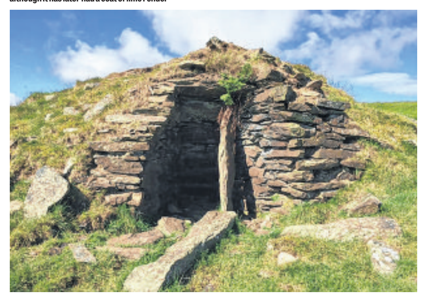
Druidale lime kiln-possibly peat-fired

ciers, and beds of clay formed as water drained from hills, from periods of higher sea level, and from melting glaciers. This sequence of layers can be seen when, for example, there are landslips which remove the vegetation from the face of brooghs at the inland edge of the Ayres – you can see layers of sand and gravel with occasional layers of clay - the clay may be less than a foot thick but it serves to trap rainfall.