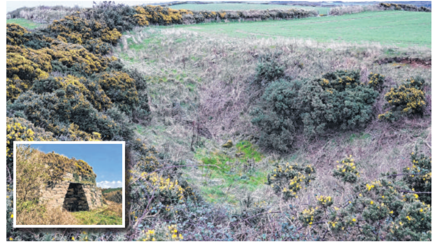
A typical marl pit (opencast clay mine) in Andreas, nearly 30 feet deep. Inset, Glen Trunk, Orrisdale lime kiln

From time immemorial, mankind has appreciated mud-from making mud-