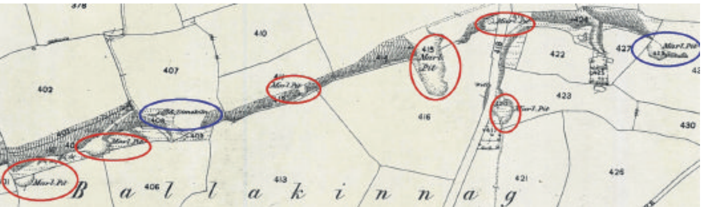
Extract from the First Edition Ordnance survey map c.1869 – within just over half a mile, there were seven marl pits and a lime kiln

It is layers of sand and gravel brought by the gla-