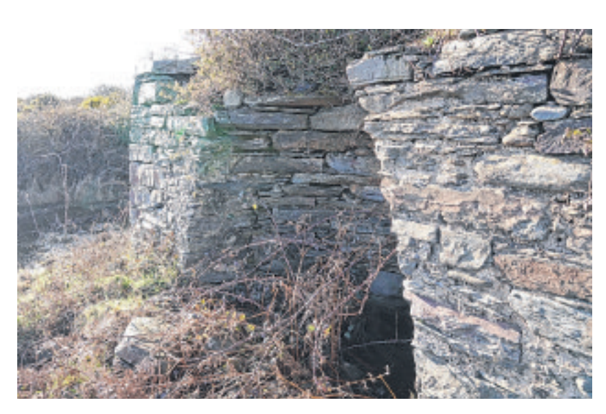
An early limekiln on the Ayres below Ballagarrett, Bride – note that the stonework has only been bonded with clay, although it has later had a coat of lime render